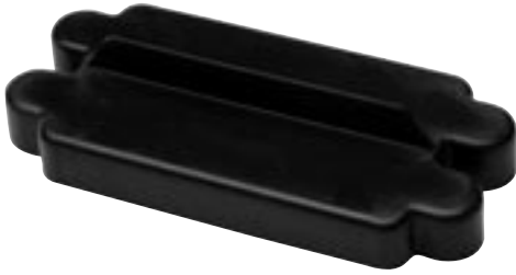
PC A1 Fits A-101 and A-101-OS Index Covers