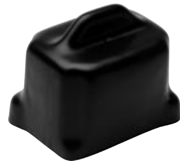
PC R-40G Fits R-40G Index Cover