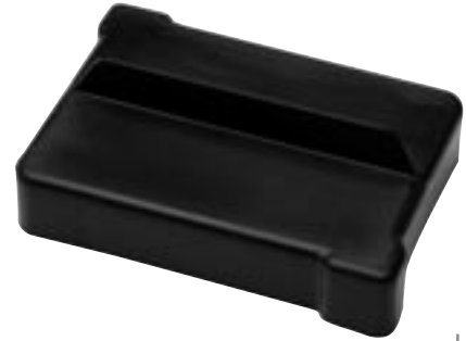
PC R3 Fits R-103, R-103-OS, and R-104 Index Covers