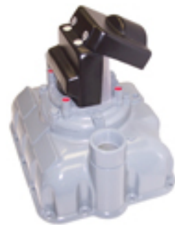
PC A3 Hinged Fits A-103