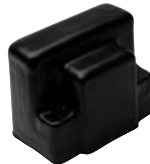
PC R5 Fits R-105 Index Cover