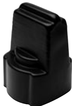
PC A3-40G Fits A-103 Index Cover and Commercial American 40G ERT