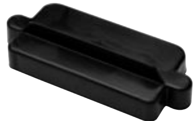
PC S5 Fits S-105 Index Cover