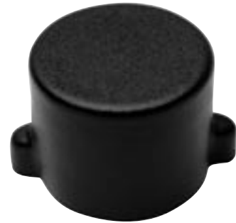
PC Sensus W Fits SENSUS Water Meter