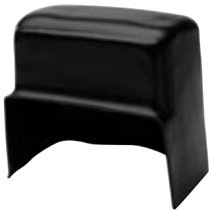
PC A3 Fits A-103 and A-103-OS Index Covers