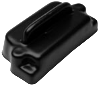
PC N8 Fits N-108 Index Cover