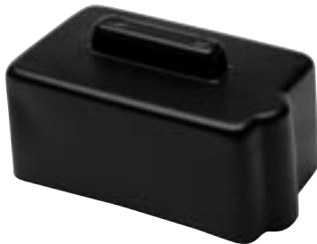
PC Cellnet R Fits Cellnet Rockwell