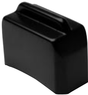
PC A-40G Fits A-40G Index Cover