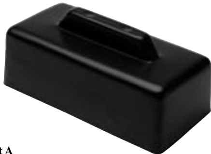
PC Cellnet A Fits Cellnet American