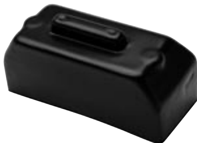
PC Cellnet S Fits Cellnet Sprague